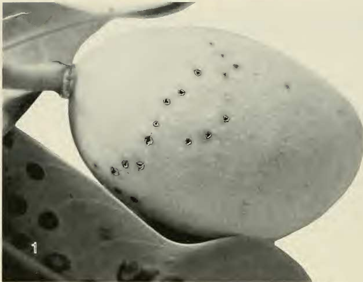
Fig. 1. Young mango fruit with holes made by larvae of Procontarinia frugivora .